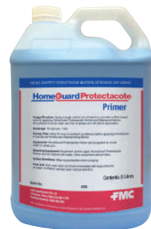
HomeGuard Protectacote Primer 5L