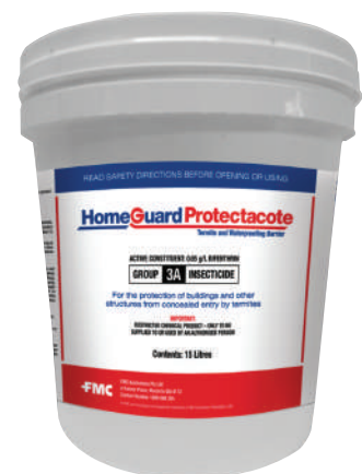
HomeGuard Protectacote 15L