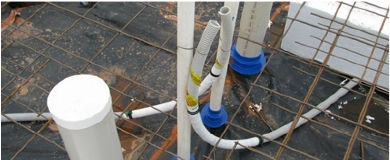
Above image is showing conduit wrapped with HomeGuard TMB.